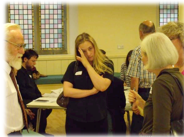
Different generations discuss priorities for Alnwick and Denwicks Future

After the touring of the tables a general questions and Answers session occurred to bring the workshop to an end as one whole group. The broad discussion is recorded in the Findings Section of the report After this Q and A each person who had attended the workshop was asked to record down their top 3 priorities for the Alnwick and Denwick Neighbourhood Plan. This would help the steering group begin to strategically plan some objectives for the plan and begin a move toward a set of preferred options for Alnwick and Denwick around key themes highlighted from the findings of the workshop.