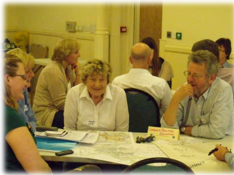
Discussing the What, Why, How and When for the Plan

The findings from this part of the workshop have been recorded and are attached to the overall report under the 8 different topic headings. The content of each of the individual groups has been left as originally presented as some facilitators chose to write up the findings of their workshop in different ways and undertake different sections of the workshop at different times. The key information however is there to see in the relevant tables and presented in the same format. Some groups produced more information on certain parts of the discussion under the various headings.