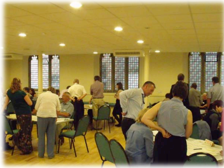
Touring the tables – asking questions and sharing information